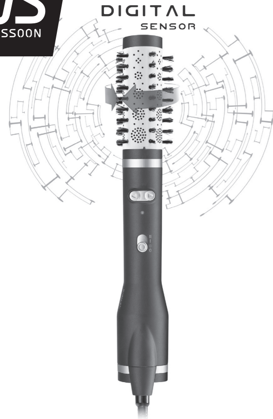
The Intelligent Hot Air Styler For the ultimate blow dry finish.